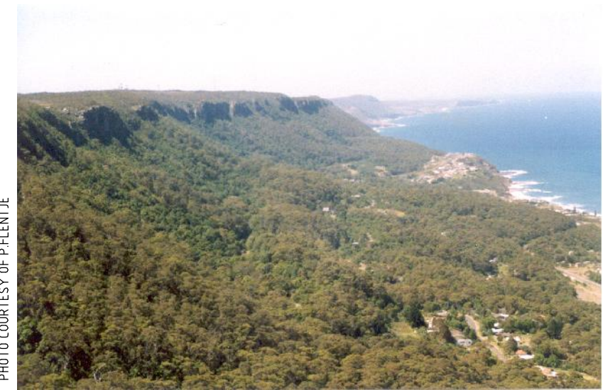
2B AERIAL VIEW OF ESCARPMENT