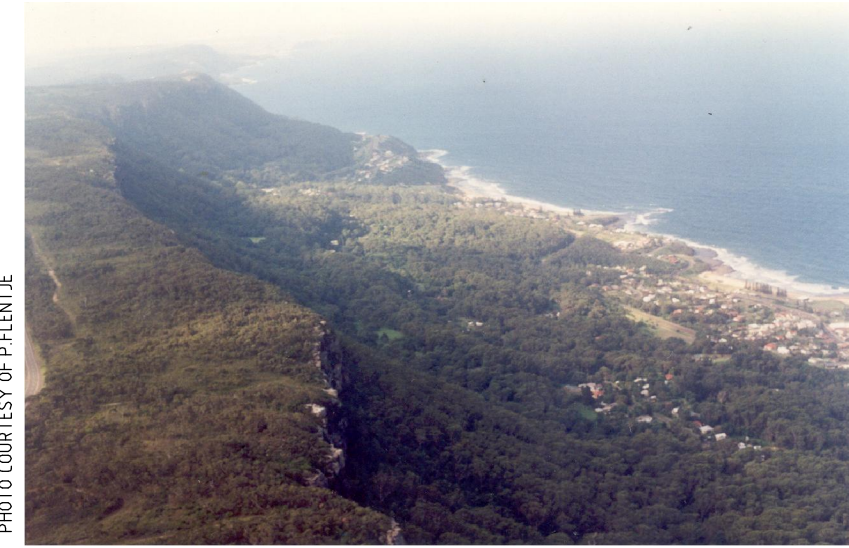
2A AERIAL VIEW OF ESCARPMENT AND COASTAL PLAIN